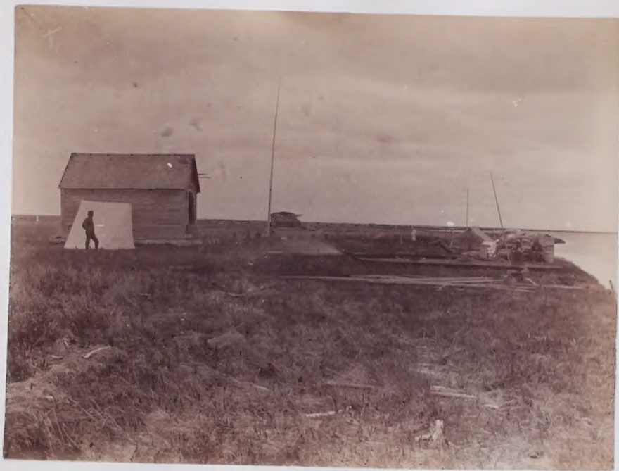
17. Ware House, Kuskokwim Bay